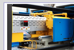
TÜV Rheinland Certified