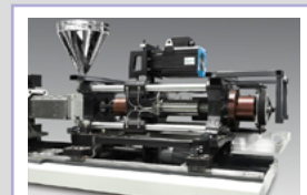
Robust Injection Unit