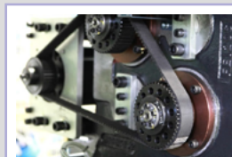
Belt Driven Ejector